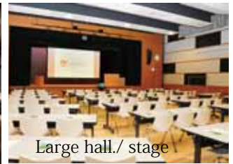
Large hall./ stage